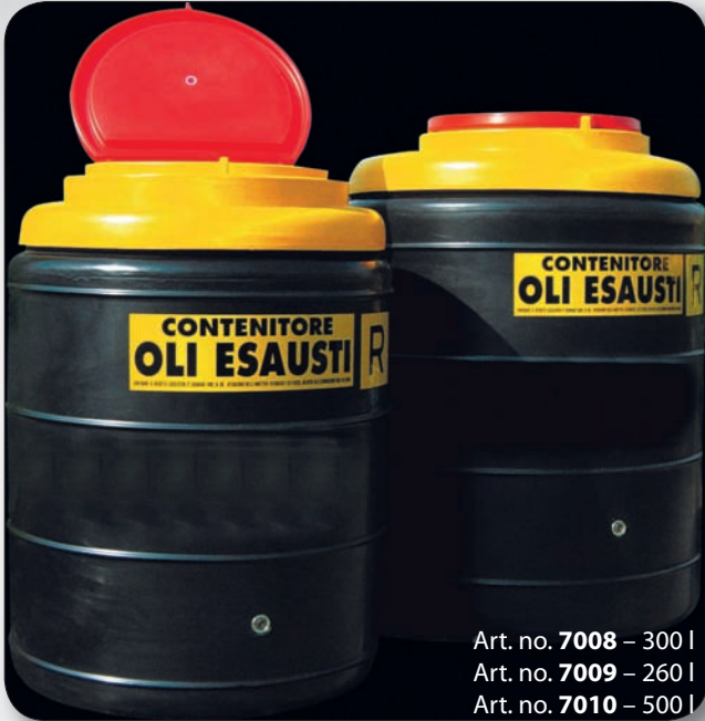
Art. no. 7008 – 300 l Art. no. 7009 – 260 l Art. no. 7010 – 500 l

Waste fluids storage tanks, made in plastic or in steel, compliant with the valid norms regulating the storage of waste fluids (Italian directive 392/96 according to European directives 75/349 EEC and 87/101 EEC).