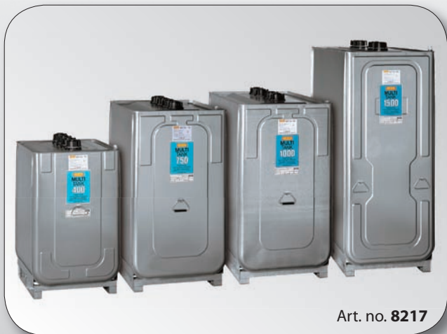
Art. no. 8217