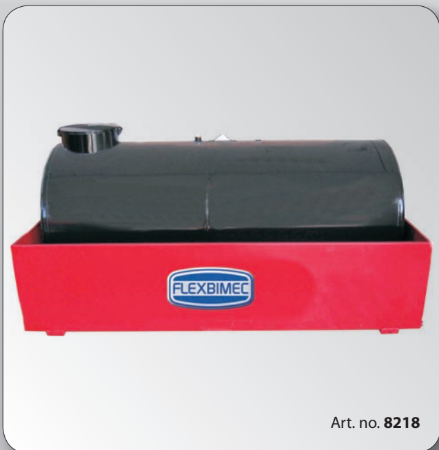
Art. no. 8218

On demand are available also the same models, but approved for transportation in accordance with ADR 6.5.4.4.1b.